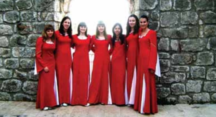
THE FEMALE ENSEMBLE (KLAPA) FORTUNA