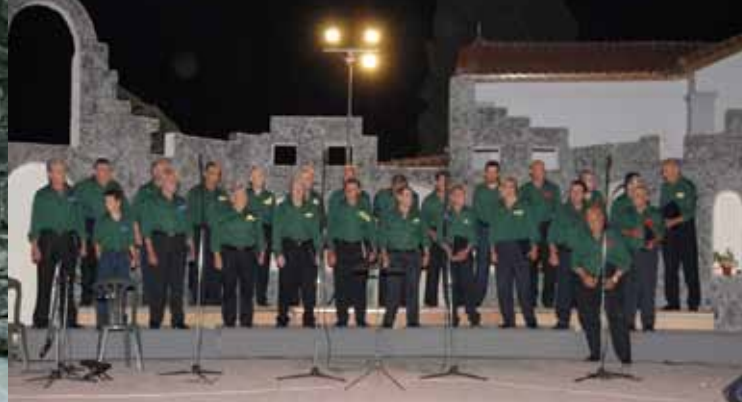
CULTURAL ASSOCIATION OF ATALANTI «THE PROGRESS»